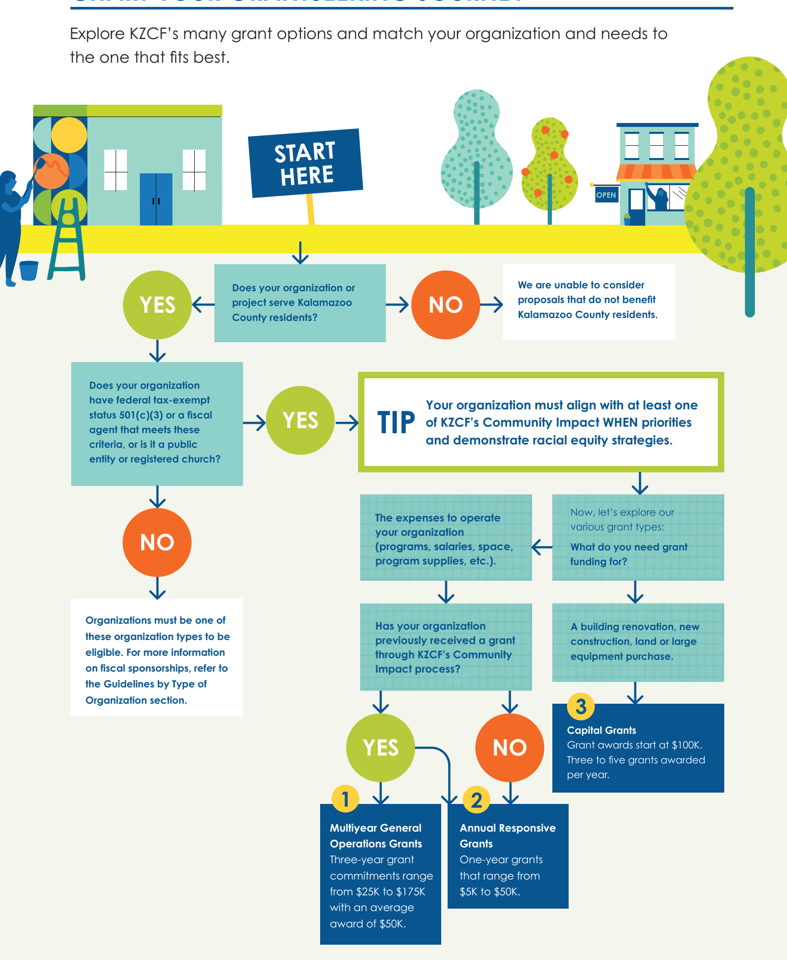
CHART YOUR GRANTSEEKING JOURNEY