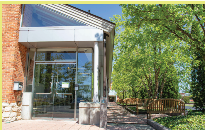
View of the main entrance from the guest parking lot.

Unless stated by a team member, all guests should expect to use our main entrance.