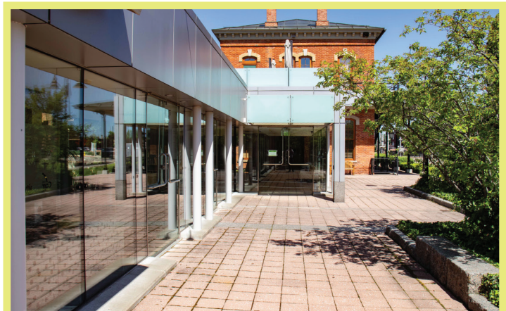
View of the Winter Garden entrance in the back of the building.