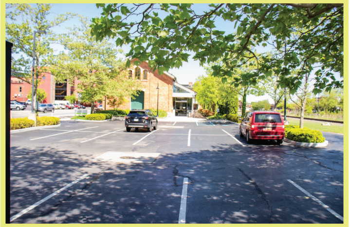
View of the guest parking lot from the employee parking lot.