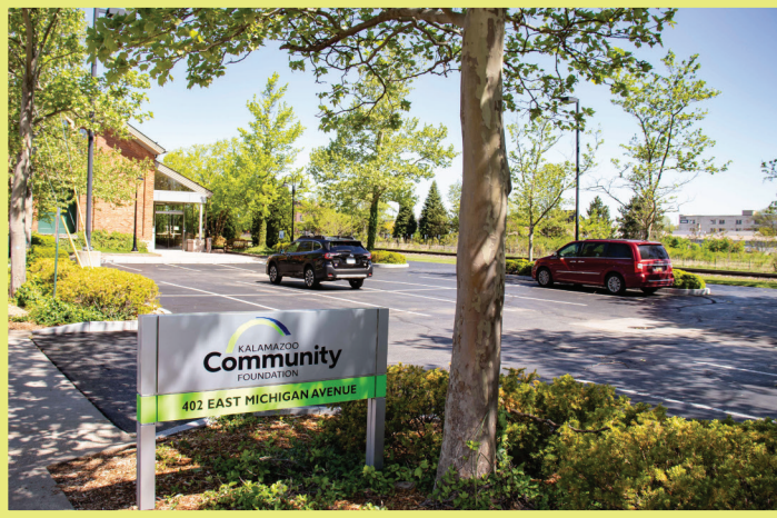
View of the guest parking lot from Pitcher Street.

KZCF owns two parking lots, a guest lot and an employee lot. Both lots are accessible only from the south side of the building, off Pitcher Street. Our guests and community partners are invited to park in the smaller lot, located closest to our building and main entrance. Please review the photos below to see this lot.